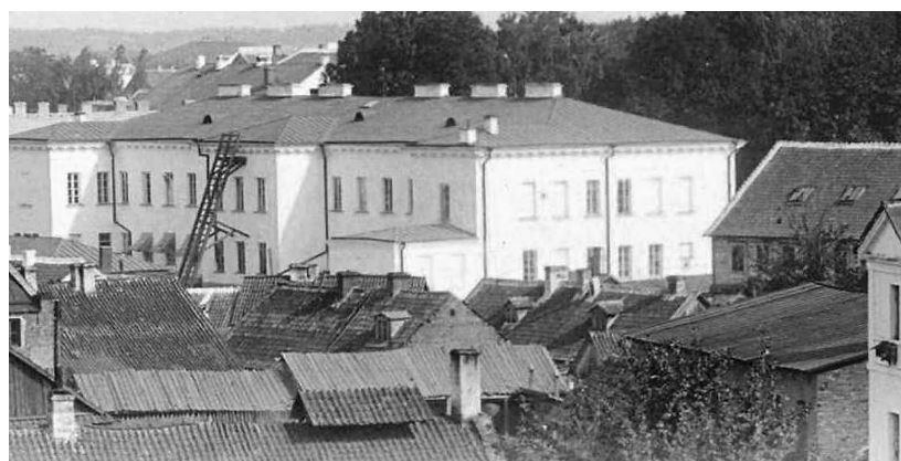
Widok z pałacowej bramy na gmach Szkoły Realnej przy ul. Aleksandrowskiej (dziś siedziba VI Liceum Ogólnokształcącego) w 1897 r.